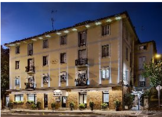
Juan Mari Arzak's restaurant.