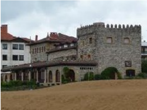
Carlos Arguiñano's restaurant.