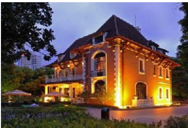
Martin Berasategui's restaurant.